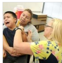
Shot Blitz at Northwest Assistance Ministries