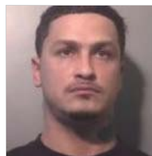
5 League City PD mug shots, Mar. 4, 2012