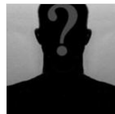
7 Friendswood PD mug shots, Mar. 4, 2012